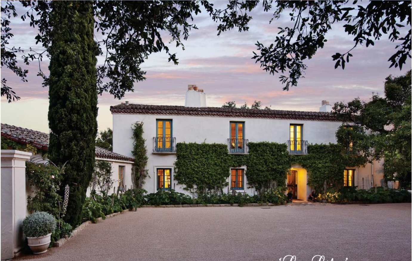
'Les Lilas' Montecito, California